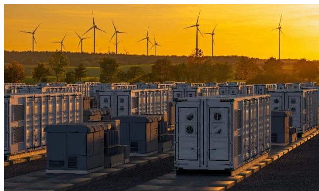
Figure 1. An AI generated image depicting the coupling of renewable energy and energy storage

Two groups focused on electrochemical storage, one on thermal storage, and one on mechanical and hybrid solutions. This distribution is also reflected in the number of final results, with some areas presenting more topics than others. The authors consider this as a reflection of the asymmetric nature of the research and innovation landscape within the field.