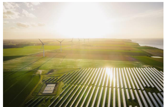
Figure 5. Wind turbines and solar panels farm in a field.

Experts noted that recycling economics depend strongly on material value: low-metal-value batteries require low-cost recycling processes and/or support from policy initiatives, while technologies using high-value materials can be designed with a full-cycle recovery in mind.