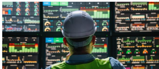
Figure 4 – Worker with a digital dashboard