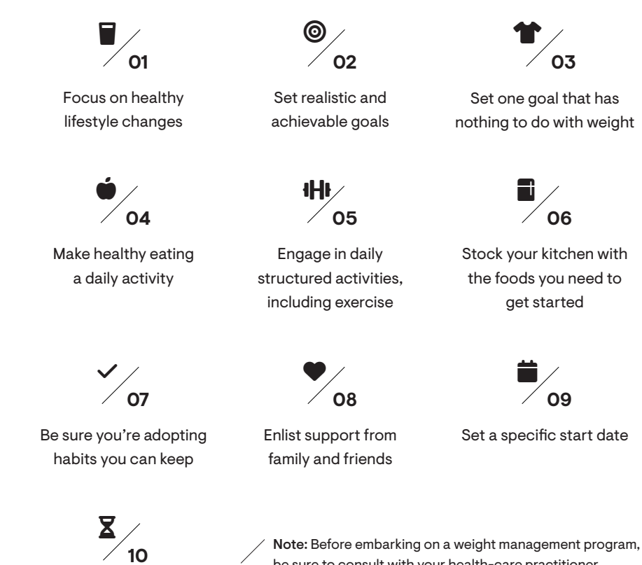
Adopt new habits slowly

be sure to consult with your health-care practitioner.