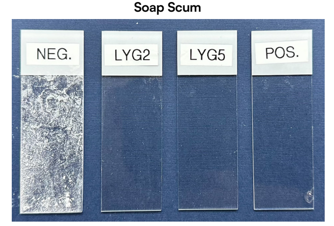
Soap scum and limescale removal: Lygos internal lab testing.

Marketing Sell Sheet: Cleaners Document No: MSS-004 | Version 2.0