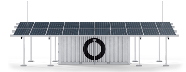
Off-Grid Europe Solar Mini-Grid System (Containerized Solution)