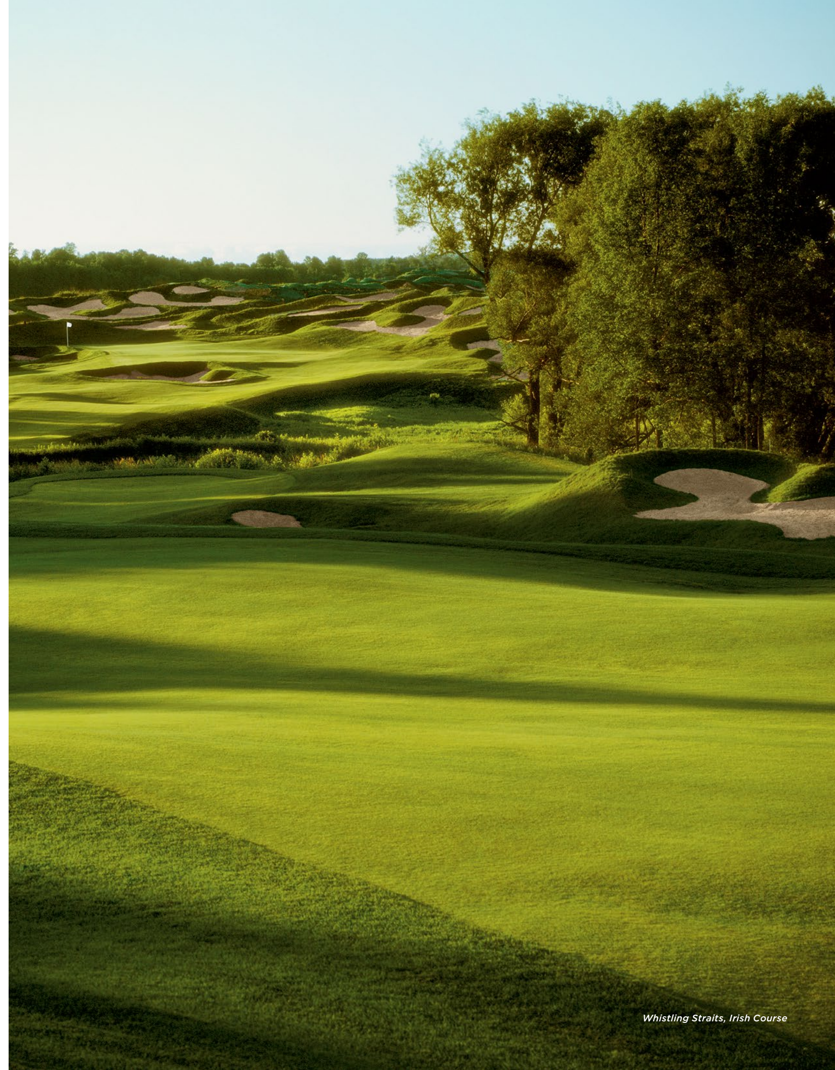
Whistling Straits, Irish Course