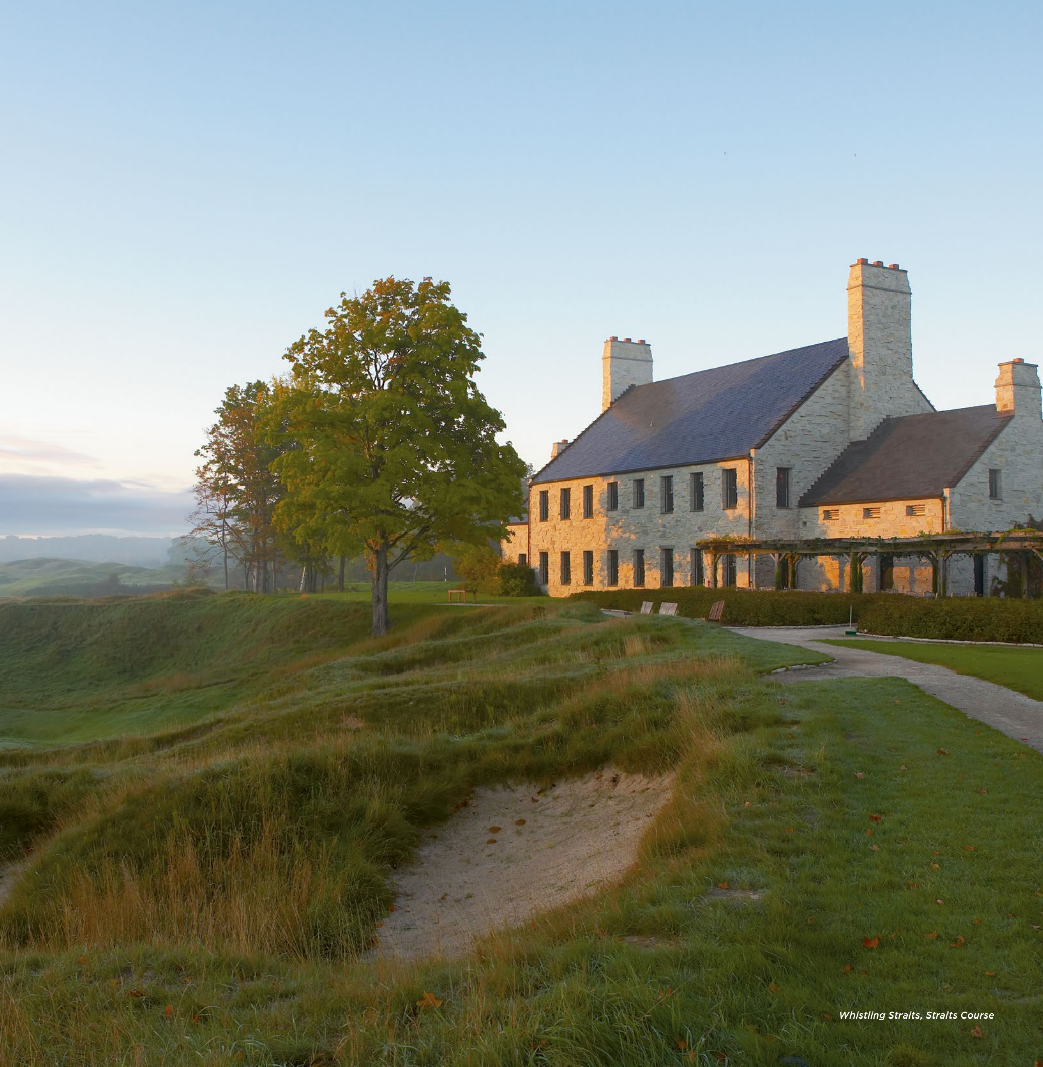
Whistling Straits, Straits Course