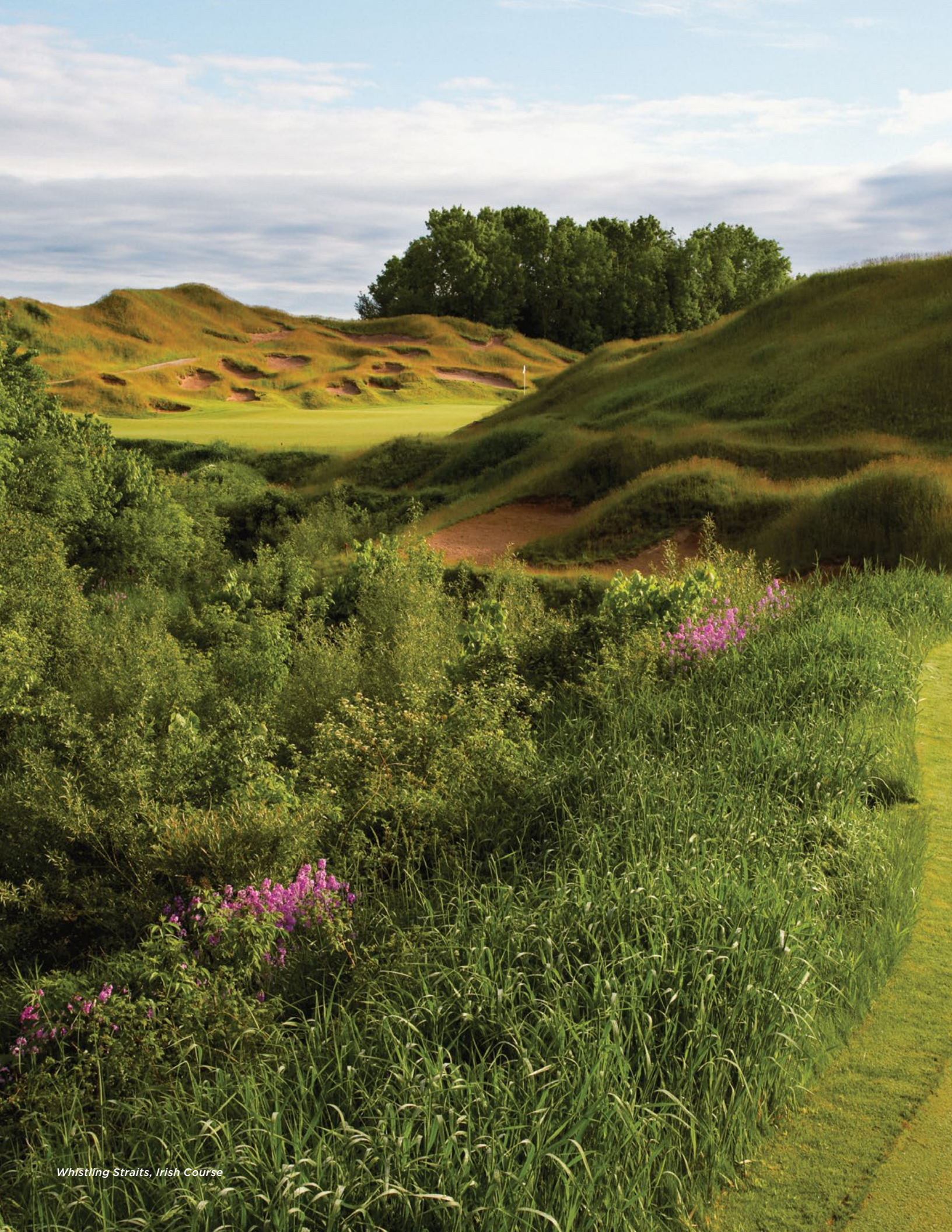
Whistling Straits, Irish Course