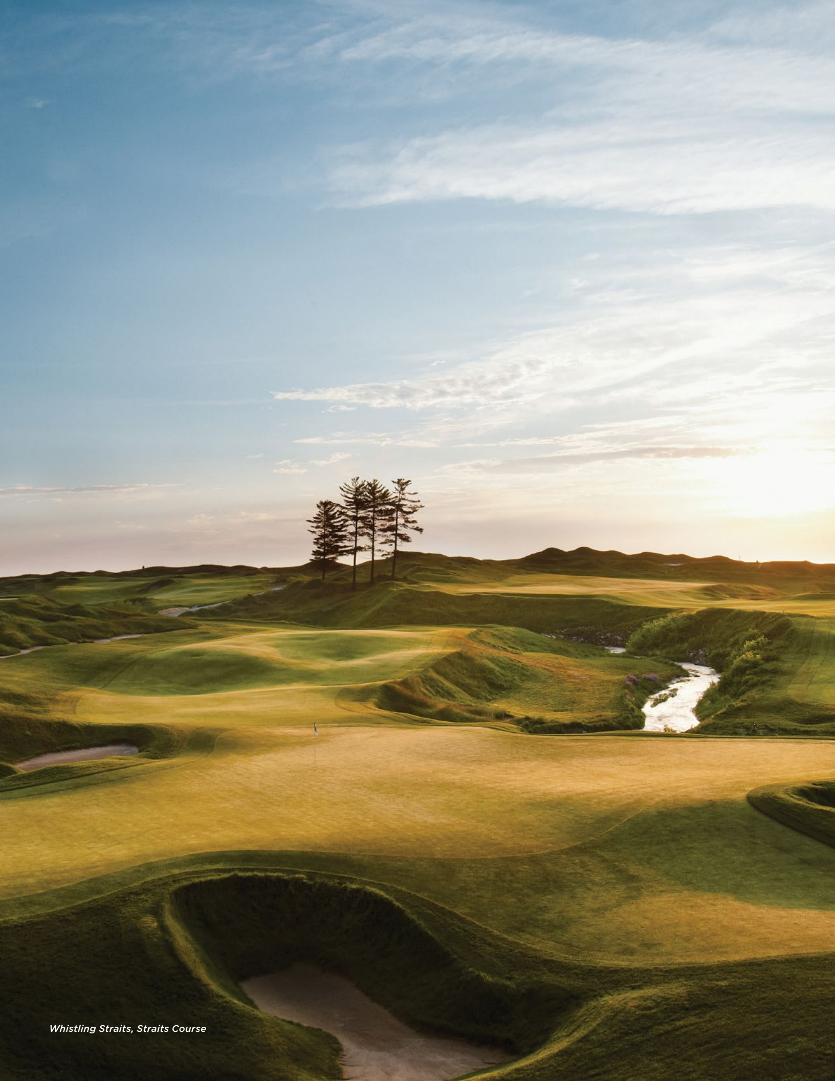
Whistling Straits, Straits Course