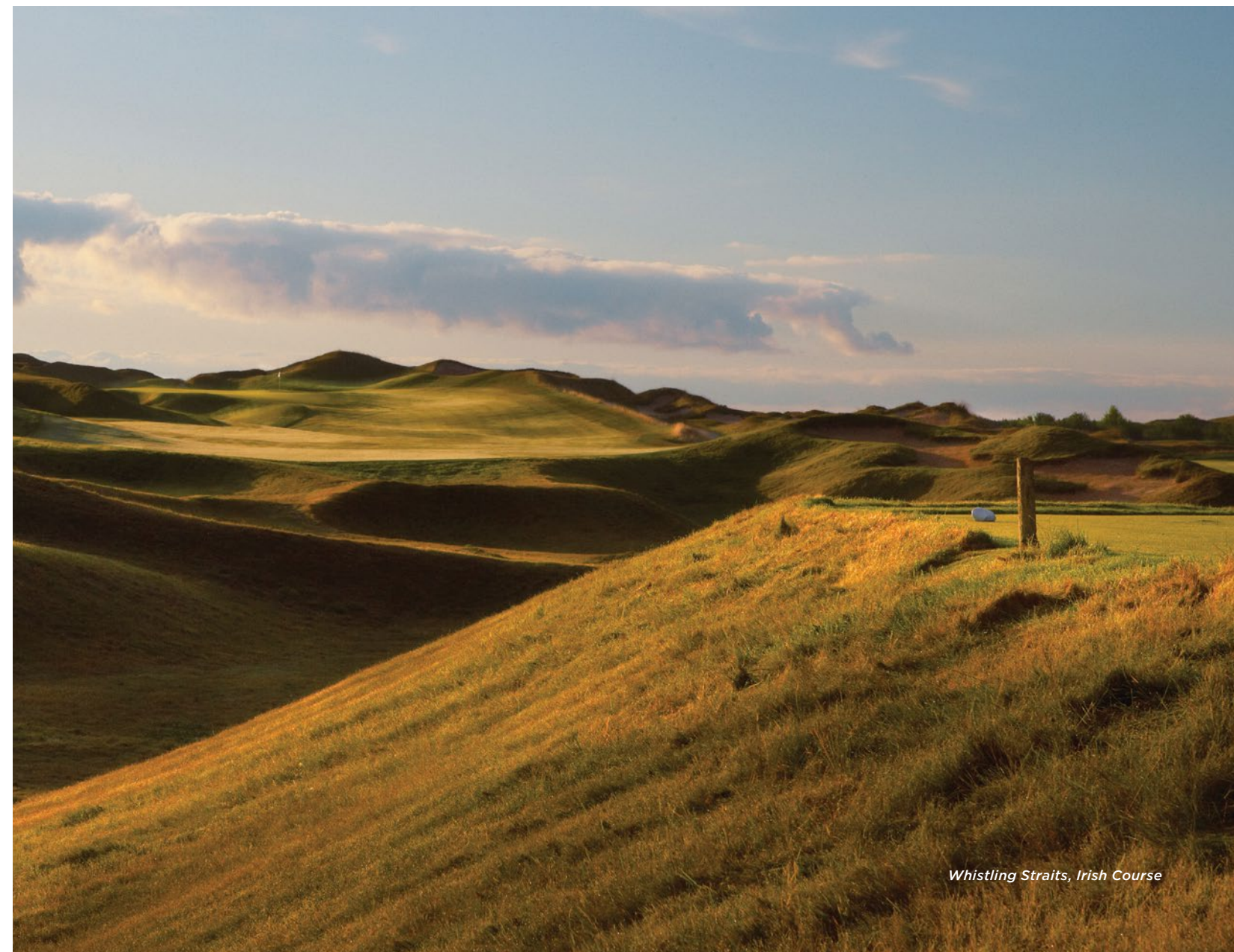
Whistling Straits, Irish Course

Every Applied guest's entry into the tournament and green fees are covered by Applied Underwriters, and all competitors will receive a complete gift pack, as well as a chance to win prizes, including an invitation to the Applied Underwriters Invitational National Finals by winning your local event.