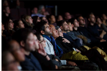
Audience members at the Architecture and Design Film Festival in 2024.

LOOP — From Downtown skyscrapers to neighborhood bungalows, from Louis Sullivan to Frank Lloyd Wright, Chicago has long been a hub of innovative architecture. The Chicago Architecture Center is honoring that legacy with the Architecture and Design Film Fest — a five-day event that spotlights architects and design philosophies from around the world.