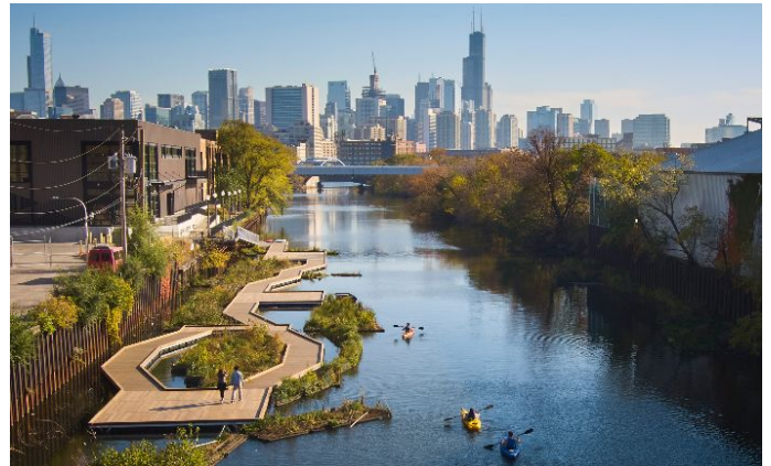
The Wild Mile blends recreation and habitat restoration on the North Branch of the Chicago River.

In our region, two main climate-related perils endanger residents and impact quality-of-life: the urban heat island and increased flooding and shoreline erosion. Temperatures in urban neighborhoods at the end of the hottest days can exceed outlying areas by as much as 15-20 degrees Fahrenheit, or an average of 7-9 degrees in summer. It took a massive loss of human life in the 1995 heat wave to wake Chicago up to the grossly unequal distribution of tree canopy shade by income and race. There's much work to be done: despite an estimated four million trees within city limits, Chicago's overall canopy coverage decreased from 19% to 16% between 2010 and 2020. Our 2008 Climate Action Plan called for at least one million more in areas of need by 2020; only 77,000 were planted. The 2022 Climate Action Plan promises 75,000 new trees planted in historically underserved neighborhoods by 2026, and as of April 2024 about 41,000 trees had been planted in the public way.