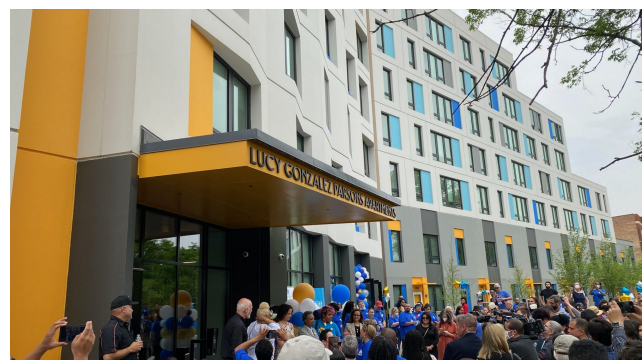
The Academy for Global Citizenship campus on the Southwest Side (top), designed by Farr Associates; and Lucy Gonzalez Parsons Apartments in Logan Square (bottom), an example of equitable transit-oriented development (ETOD), designed by LBBA Architects.