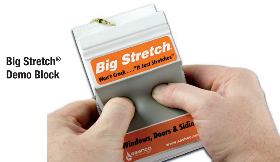
Big Stretch® Demo Block