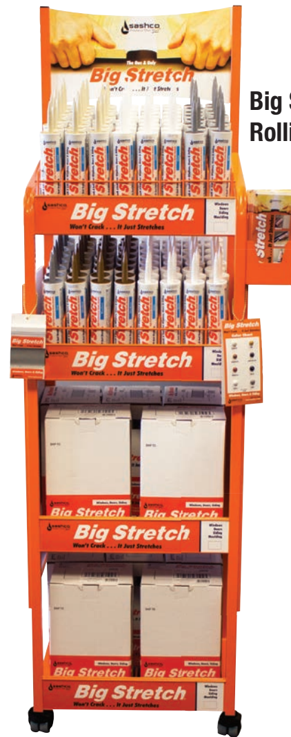
Big Stretch® Rolling Rack