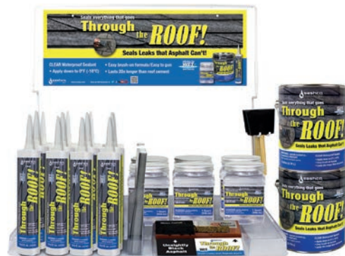
Through the Roof!® 2 ft. Countertop Display