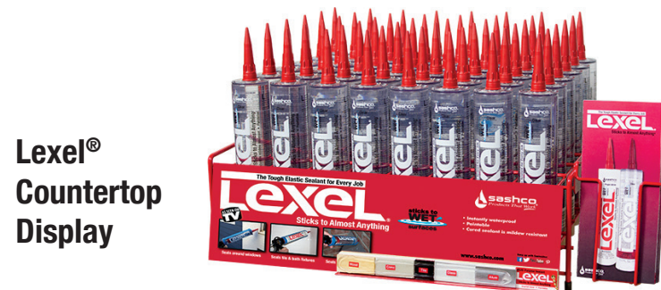
Lexel® Countertop Display